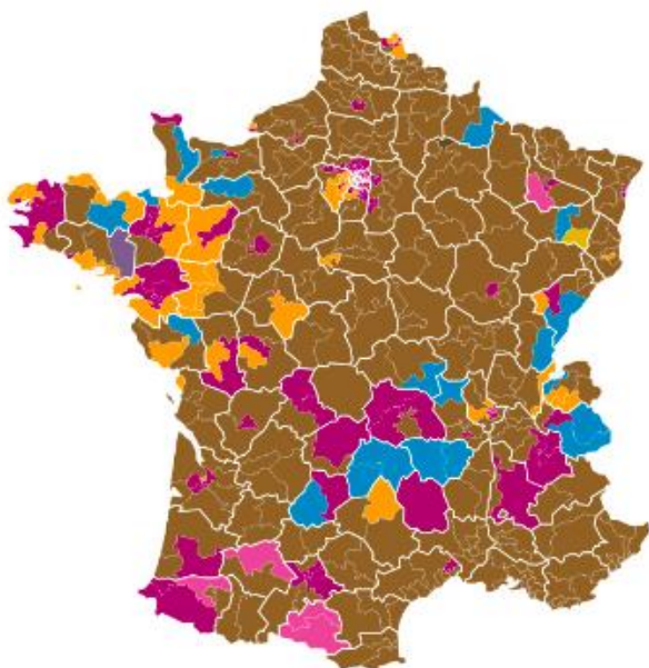
Figure 3: 2024 Map of French electorates after first round voting